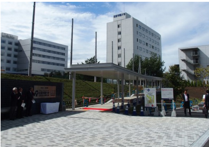
The opening ceremony of “Covered Walk”

A new walking path “Covered Walk” is opened at the south-side gateway of the campus. Passing through the Hidamari Road, a cycling road, from Oyachi subway station, pedestrians will have a sprawling view of the campus after emerging from the tunnel. To ensure the safety of students and other passersby, the passage to the university has been separated by an exclusive path