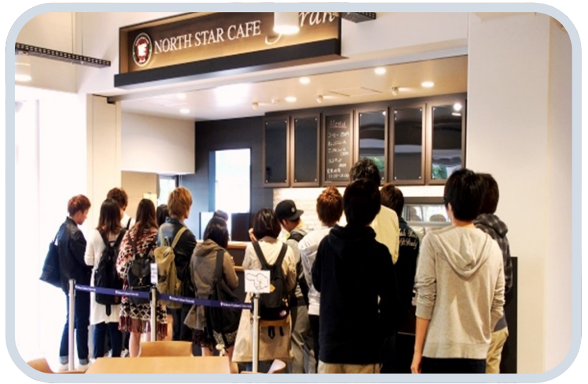
Students are lined up in waiting for making orders.

In addition, it will hold the so-called “International Time,” an event in which international students work as the waiting staff and students can make orders in foreign languages. On November 17, “International Café - Indonesia Day” was held. Students tried to order in Indonesian by referring to the prepared paper which showed how to order in Indonesian.