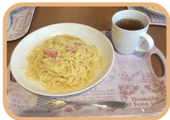
One of the set menus: carbonara and a cup of soup