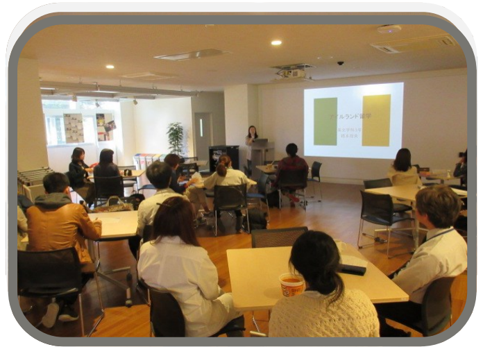
International Lounge is in the inner part of the first floor.

The International Lounge provides both Japanese and foreign students an opportunity for learning together. As one of the newly introduced projects by the International Education & Language Center, the event for playing games by speaking in foreign languages has started from November. In this event, Japanese students can interact with foreign students through playing a few