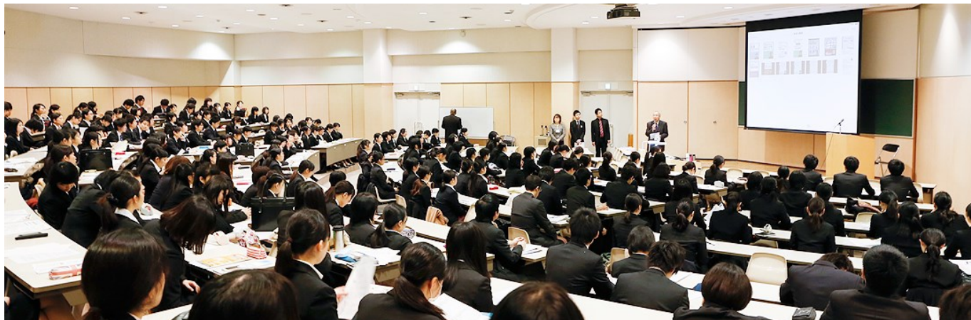
Students in formal suits attend a career program for learning about job interview techniques.