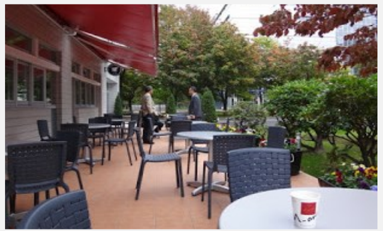
On a sunny day, students are able to have foods and drinks at the outside terrace.