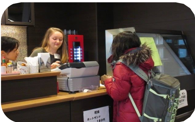
“Indonesia Day”: A student tries to order food and a foreign student is in charge of a cashier as a wait staff.