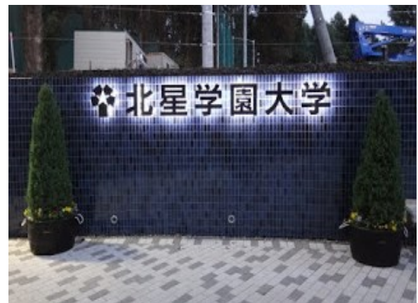
The university nameplate and the logo is being illuminated on the tiled wall.

A new walking path “Covered Walk” is opened at the south-side gateway of the campus. Passing through the Hidamari Road, a cycling road, from Oyachi subway station, pedestrians will have a sprawling view of the campus after emerging from the tunnel. To ensure the safety of students and other passersby, the passage to the university has been separated by an exclusive path