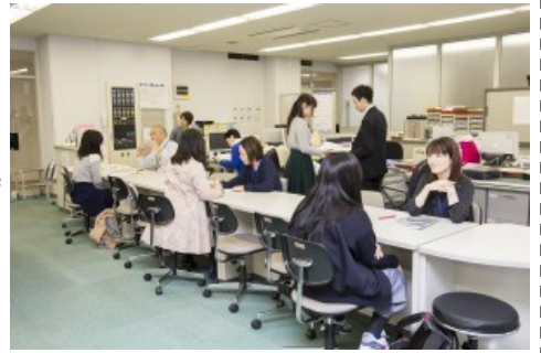
Students consult with support advisers.