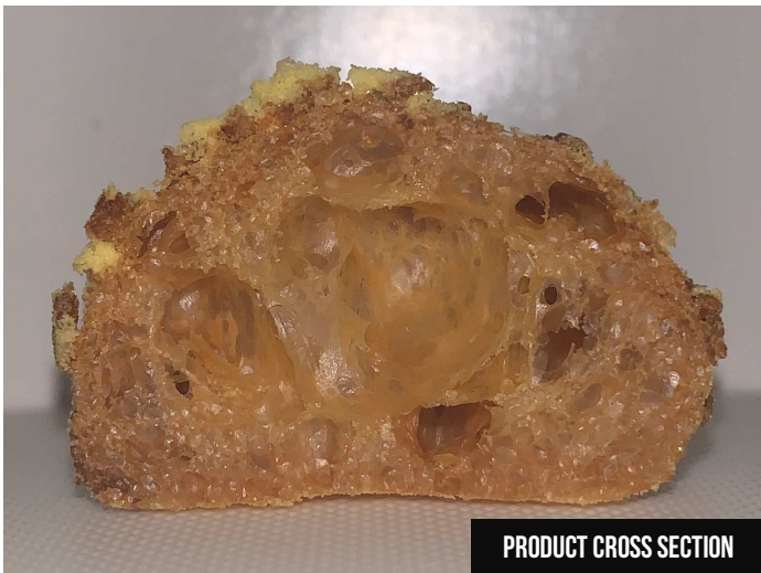
PRODUCT CROSS SECTION