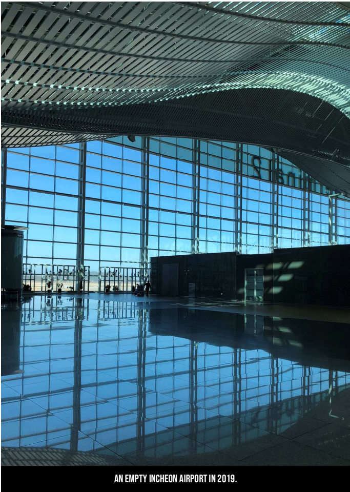
AN EMPTY INCHEON AIRPORT IN 2019.