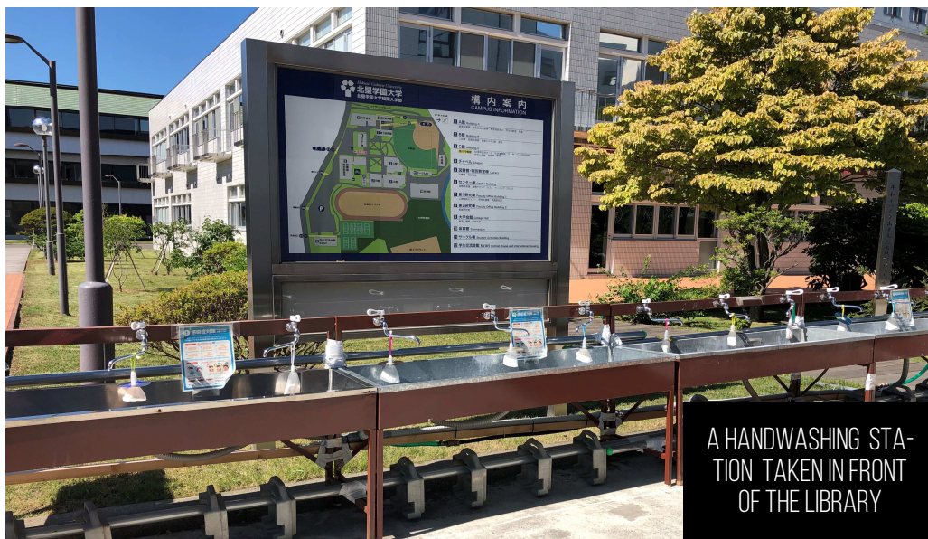
A HANDWASHING STATION TAKEN IN FRONT OF THE LIBRARY

DUE TO THE COVID-19 PANDEMIC, IN ADDITION TO THE INTRODUCTION OF ONLINE CLASSES, HOKUSEI GAKUEN UNIVERSITY HAS TAKEN SEVERAL MEASURES TO PREVENT THE SPREAD OF INFECTION ON CAMPUS.