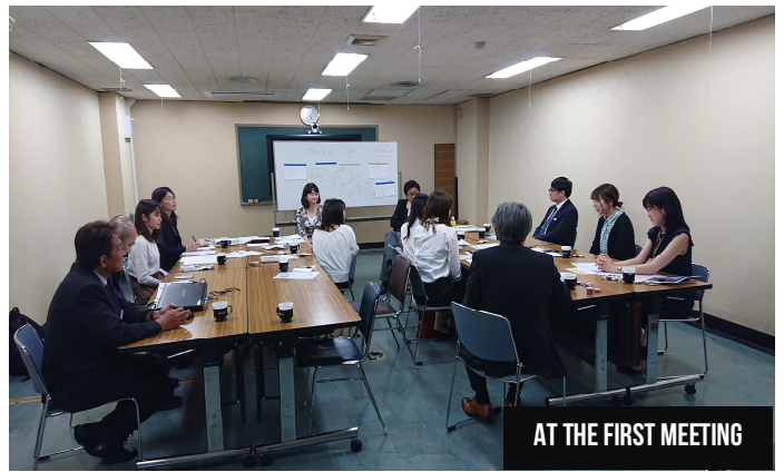
AT THE FIRST MEETING

The students also had some insights to share with the pros. They made a presentation about a survey that they previously took about "trendy sweets", "sweet styles that young people want to buy", and "sweets that youth like", and discussed some ideas with the people from each company