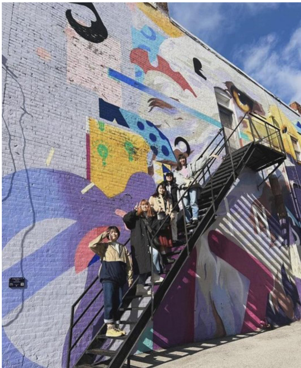
LOCAL SIGHT SEEING The students of Hokusei Gakuen University tour the town of North Manchester. Their visit to the United States, a part of their school’s International Education Program, lasted from Feb. 8–12.