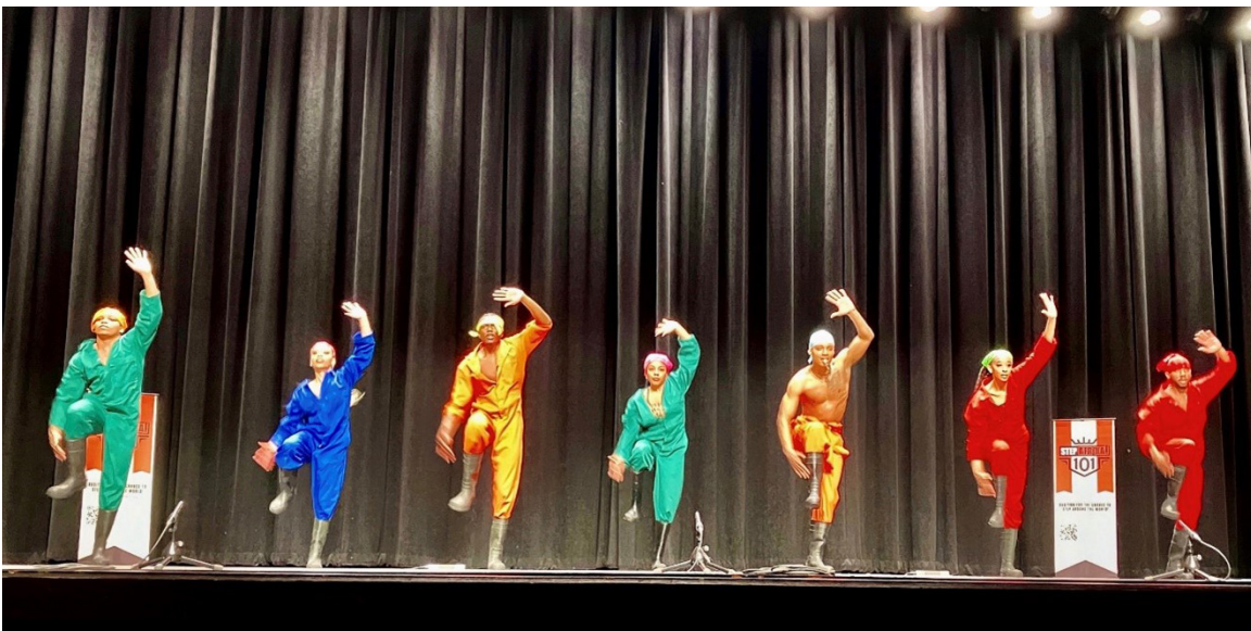
GUMBOOT STYLE In colorful garb, members of the Step Afrika dance company perform a traditional gumboot dance. The jumpsuits, bandannas and boots represent the history behind the dance.