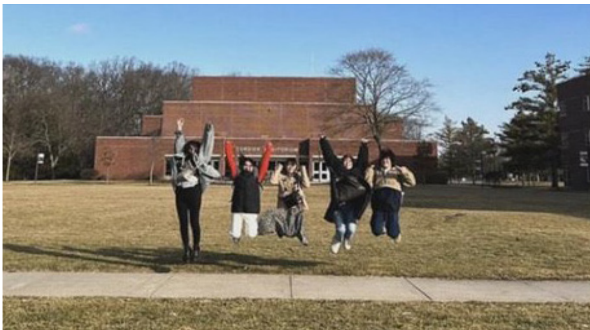
JUMP FOR JOY The students of Hokusei Gakuen University pose in front of Cordier Auditorium. The five visited the Manchester University campus during their spring break.