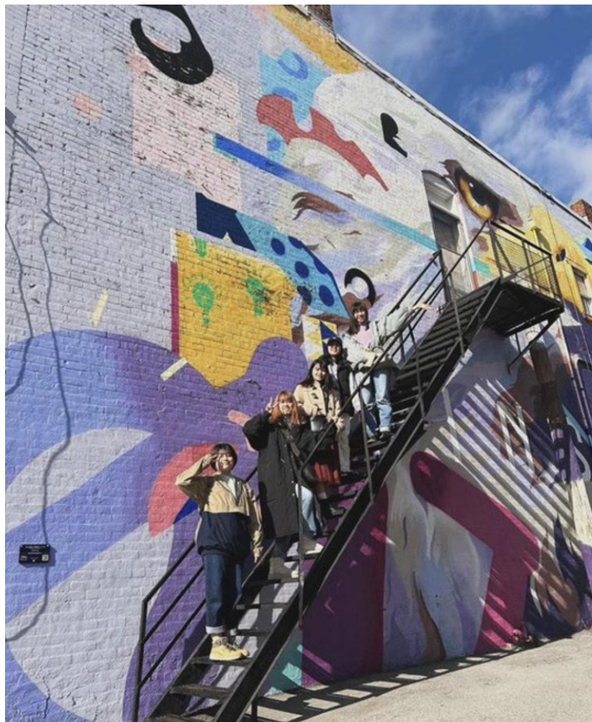
LOCAL SIGHT SEEING The students of Hokusei Gakuen University tour the town of North Manchester. Their visit to the United States, a part of their school’s International Education Program, lasted from Feb. 8–12.