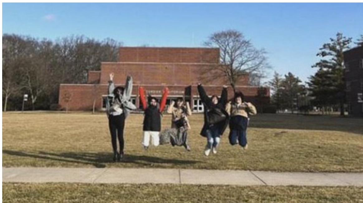
JUMP FOR JOY The students of Hokusei Gakuen University pose in front of Cordier Auditorium. The five visited the Manchester University campus during their spring break.